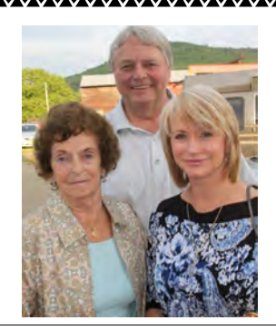
The Joyce Family attends the Wall of Fame ceremony