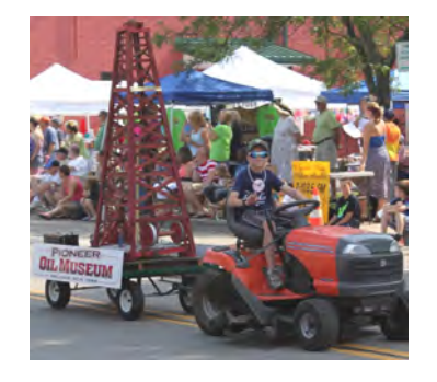
The POM float on display